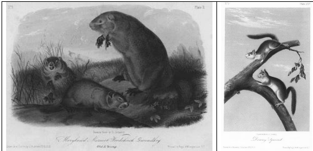
Shown in B&W, the cloud-like ink printed background is seen in the left image. The right image shows the rectangular ink printed background. (not to scale)

The Quadrupeds of North America Octavo Editions (1849-71). There were four different original Audubon octavo editions published between 1849-1871, each consisting of 155 different hand colored stone lithographs issued in three volumes of 50, 50 and 55 plates. There is no plate mark or watermark on the paper. The white paper is somewhat stiff, like a card stock. Each print should measure about 7" x 10-1/2" to 11" after removal from its original book volume, and should have a binding edge along one side, with tiny holes or slits as evidence of the print having been stitched into a book volume. There may also be evidence, along the binding edge, of a narrow glue strip where a tissue guard was glued on to protect the image. If the binding edge has been trimmed off, the value of the print is somewhat reduced. All prints in all editions have an aqua or beige ink printed background (see below) that is either a solid rectangle, or with white patches to resemble clouds and sky in landscape scenes. All are finished with hand applied watercolor paints of the era.