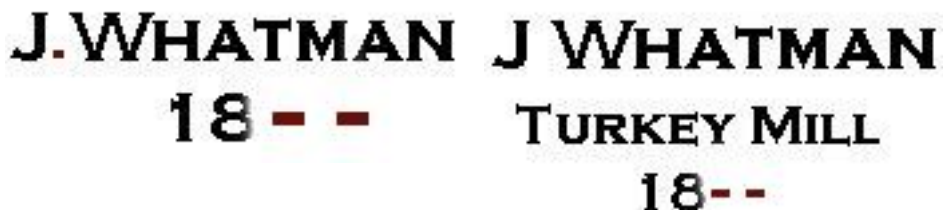
Depictions of the two (2) different J. WHATMAN watermarks