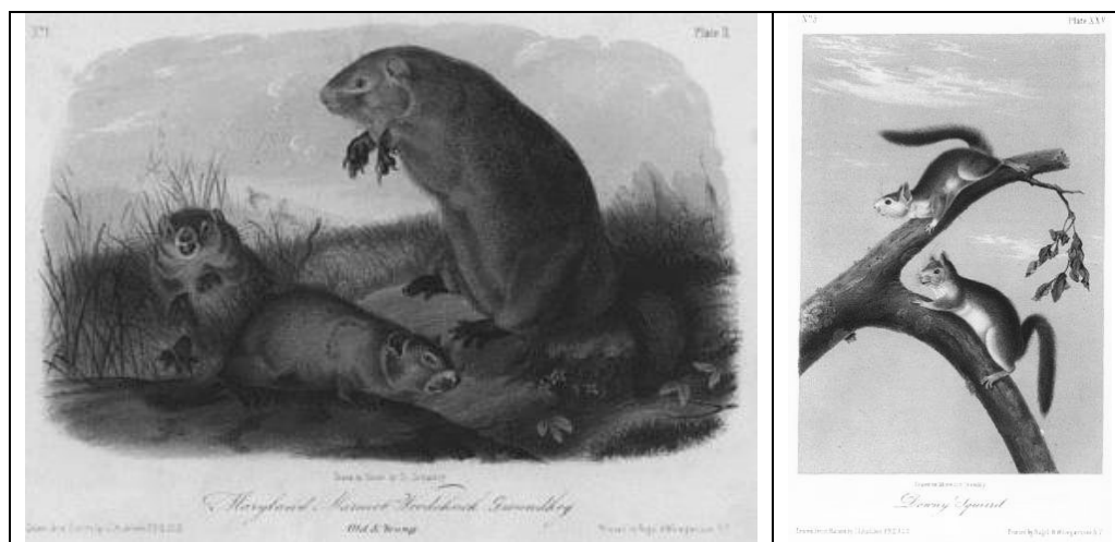
Shown in B&W, the cloud-like ink printed background is seen in the left image. The right image shows the rectangular ink printed background. (not to scale)

The Quadrupeds of North America Octavo Editions (1849-71). There were four different original Audubon octavo editions published between 1849-1871, each consisting of 155 different hand colored stone lithographs issued in three volumes of 50, 50 and 55 plates. There is no plate mark or watermark on the paper. The white paper is somewhat stiff, like a card stock. Each print should measure about 7" x 10-1/2" to 11" after removal from its original book volume, and should have a binding edge along one side, with tiny holes or slits as evidence of the print having been stitched into a book volume. There may also be evidence, along the binding edge, of a narrow glue strip where a tissue guard was glued on to protect the image. If the binding edge has been trimmed off, the value of the print is somewhat reduced. All prints in all editions have an aqua or beige ink printed background (see below) that is either a solid rectangle, or with white patches to resemble clouds and sky in landscape scenes. All are finished with hand applied watercolor paints of the era.